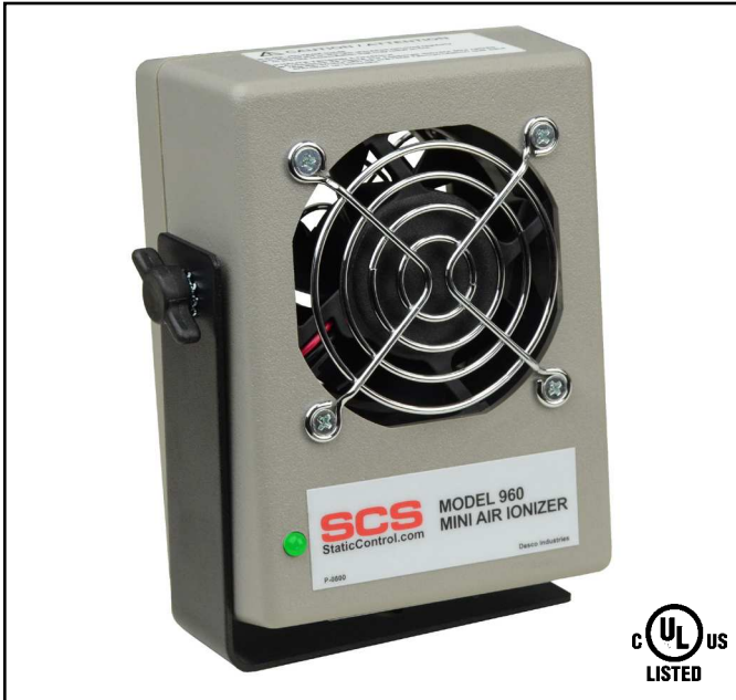
Figure 1. SCS 960 Mini Air Ionizer