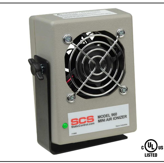
Figure 1. SCS <u>960</u> Mini Air Ionizer