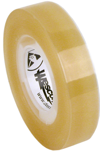
Antistatic Clear Cellulose