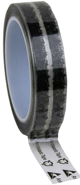
Antistatic Clear Cellulose with Symbols

Tape is wound on a low-sloughing plastic core.