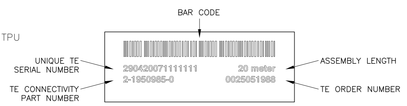
LABEL DETAIL: 3