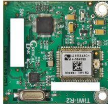
(1.7" x 1.8" – actual size)