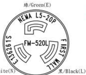
插頭端面圖 (Dimensions of Plug Face)

Insulation Thickness 0.76 mm Overall Diameter 4.00±0.15 mm