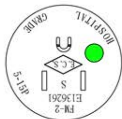
插頭端面圖 (Dimensions of Plug Face)

Insulation Thickness 0.76 mm Overall Diameter 3.45±0.10 mm