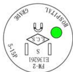
插頭端面圖 (Dimensions of Plug Face)

Insulation Thickness 0.76 mm Overall Diameter 3.05±0.10 mm