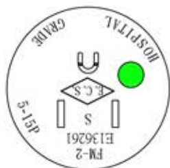
插頭端面圖 (Dimensions of Plug Face)

Insulation Thickness 0.76 mm Overall Diameter 2.70±0.10 mm