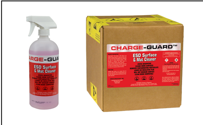
Figure 1. Charge-Guard® Surface & Mat Cleaner: 8002 1 quart (1 litre) spray bottle 8003 2.5 Gallon (10 litre) Bag-in-Box