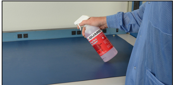
Figure 2. Applying Charge-Guard® to the mat.

Apply Charge-Guard® Surface & Mat Cleaner to the entire surface to be treated using either the pump or trigger spray bottle. Use a lint-free cloth to wipe the surface until dry. For set stains, let Charge-Guard® Surface & Mat Cleaner soak on the surface for 30 seconds before wiping clean.