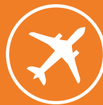
Aerospace & Defense