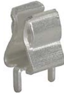
Solder THT version silver-plated