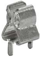
Solder THT version tin-plated