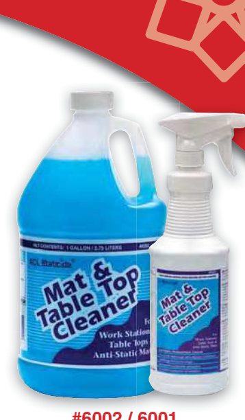
#6002 / 6001