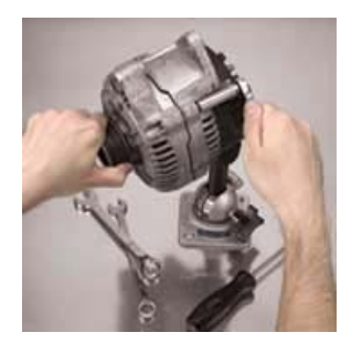
Click on any of the above images to find out more about the products pictured.