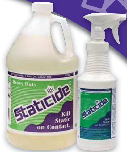
#2002 / 2005

Product #2005: 1-quart bottle / 12 quarts per case (includes trigger sprayer) Product #2002: 1-gallon bottle / 4 gallons per case Product #2002-5: 5-gallon pail Product # 2002-2: 50-gallon drum