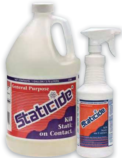
#2001 / 2003

Product #2003: 1-quart bottle / 12 quarts per case (including trigger sprayer) Product #2001: 1-gallon bottle / 4 gallons per case Product #2001-5: 5-gallon pail Product # 2001-2: 50-gallon drum