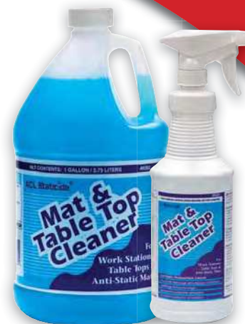
#6002 / 6001

Product #6002: Gallon bottle / 4 gallons per case