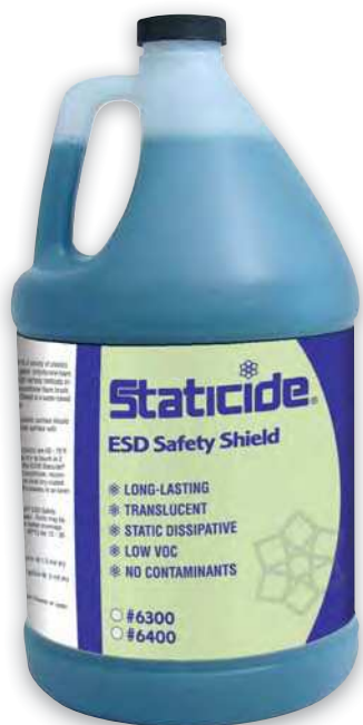
#6300 / 6400

Like our Staticide® Topicals, in the right situation, Staticide® ESD Safety Shield provides a cost-effective solution without sacrificing efficiency and quality. Suitable to use where static interferes with production assembly and ideal to use in static control environments to prevent ESD events. Use on electronic packaging, conveyor parts, and on objects in electronic assembly work areas.