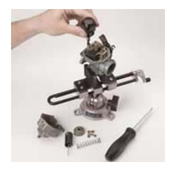
Click on any of the above images to find out more about the products pictured.