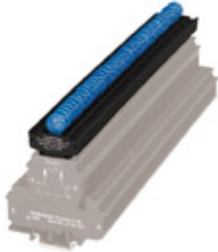
Protective plug with varistor for TERMITRAB base element TT-UKK5-T-BE, nominal voltage: 24 V DC

Please be informed that the data shown in this PDF Document is generated from our Online Catalog. Please find the complete data in the user's documentation. Our General Terms of Use for Downloads are valid ( http://download.phoenixcontact.com )