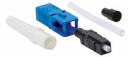
3M™ Hot Melt SC Connector

The 3M Hot Melt LC Connector in both singlemode and multimode has all the advantages of our pre-loaded hot melt technology — and at half the size of our SC connector.