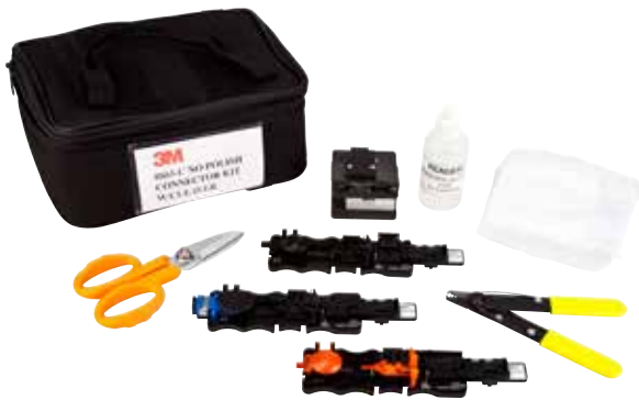
3M™ No Polish Connector Kit 8865-C