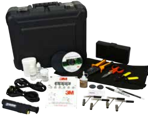
3M™ Hot Melt Termination Kits 6366 and 6362-230V

3M™ Hot Melt Termination Kits 6366 (120V oven) and 6362 (230V oven) contain the tools and materials necessary to terminate 3M™ Hot Melt SC, ST, and FC Connectors, both singlemode and multimode. The 3M™ LC Hot Melt Expansion Kit 6650-LC is used in addition to the 6366/6362 hot melt termination kits to terminate 3M™ Hot Melt LC Connectors.