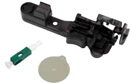
3M™ Crimplok™+ Activation Tool, a Singlemode SC APC 250/900um connector and a lapping film