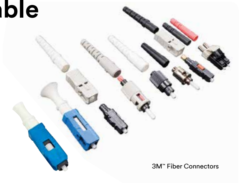
3M™ Fiber Connectors

Reliability and a craft-friendly installations make 3M field installable connectors popular among contractors and industry professionals. 3M connectors can help maximize time in the field with factory-prepped shortcuts and high performance tools. Choose from a full line of fiber connectors with ceramic ferrules.