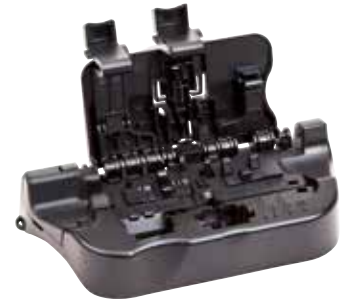
3M™ Easy Cleaver