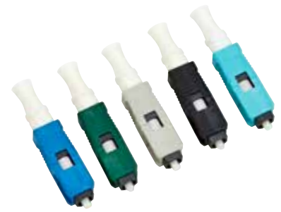
3M™ Crimplok™+ 250μm/900μm Connector Family