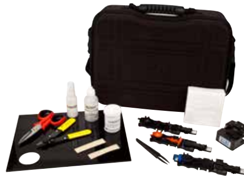
3M™ No Polish Connector Premium Kit with Cleaver 8865-C/PR