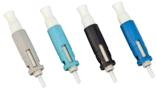
3M™ No Polish ST Connector Family