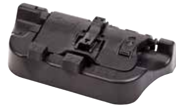
3M™ Easy Cleaver

Unlike other blade-enabled fiber cleaving tools, the 3M Easy Cleaver requires no maintenance because of its diamond wire cleaving mechanism. Use it to create smooth end-faces repeatedly – each tool performs up to 120 cleaves. See the ordering chart for specific details on packaging.