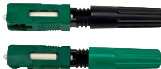
3M™ No Polish SC/APC Connector Flat and Angle Splice 1.6-3 mm Jacket