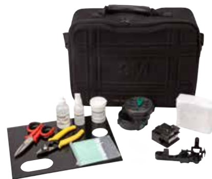
3M™ Crimplok™+ SC/APC Connector Kit 8765T-APC for 3M™ Crimplok™+ Connectors 8700-APC