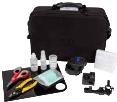
3M™ Crimplok™+ SC/UPC Connector Kit 8765T-UPC for 3M™ Crimplok™+ Connectors 8700-UPC and 6700 Series

3M™ Crimplok™+ Connector Kits 8765T-UPC/8765T-APC provide the tools needed to terminate 3M Crimplok+ Connectors 8700-UPC 6700 and 8700-APC series, respectively. Both kits contain the same fiber preparation tools including a high quality cleaver, a work surface and a case with an integrated hook for easy hanging. Each kit contains a specific 3M™ Crimplok™+ Activation Tool and 3M™ Crimplok™+ Nano Finishing Tool, depending upon the connector type. UPC tools provide a square finish while APC tools provide a 8° angled finish.