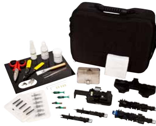
3M™ Fiber Optic Angle Cleave Kit 2565

The 3M™ Fiber Optic Angle Cleave Kit 2565 provides the tools necessary to terminate 3M™ No Polish LC/APC and SC/APC Angle Splice Connectors. The 3M™ Fibrlok™ Angle Splice Assembly Tool 2501-AS is also included to terminate 3M™ Fibrlok™ Angle Splices. Replacement parts are available.