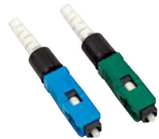
3M™ Crimplok™+ Singlemode Jacketed Connectors