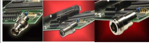
Patented V-Bite®, Snaps Into PCB, Surface Mount Center Contact