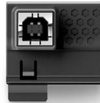
USB interface - Black