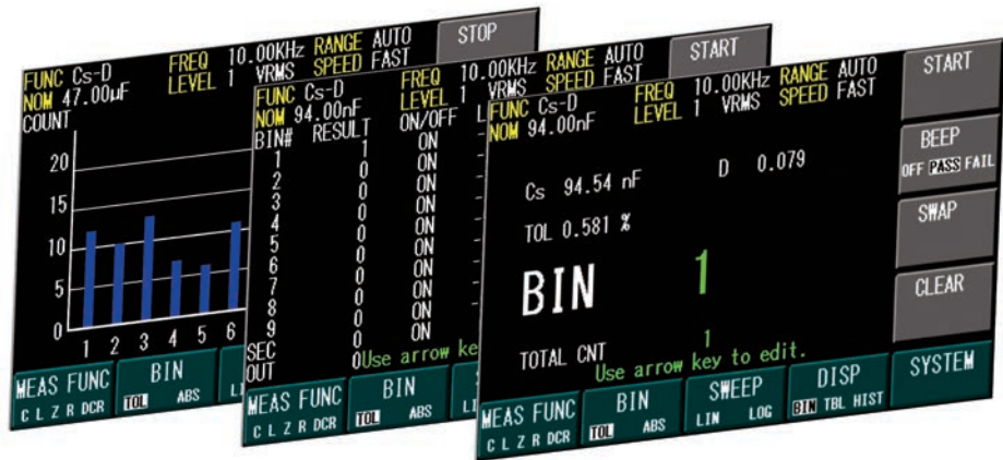
Histogram display, Table display, and Bin display

Quickly sort components with the instrument's 9 primary BINs, 1 secondary BIN, and 1 out-of-spec BIN. The results can be displayed on a table or histogram and saved to a USB flash drive. High and low limits for each bin can be set up in absolute or tolerance mode with Pass/Fail beep.