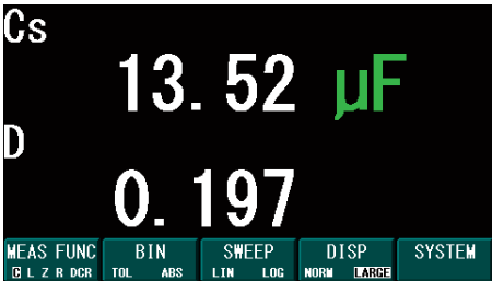
Large display mode

Users have the option to display up to 4 digits resolution on primary and secondary measurements in decimal or scientific notation. Large display mode is also available for easy viewing from a distance.