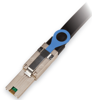
3M™ High Routability External MiniSAS Cable Assembly