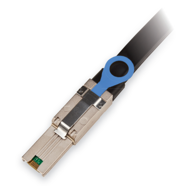
3M<sup>™</sup> High Routability External MiniSAS Cable Assembly