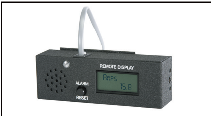
9318-0506 Remote PDU Display