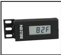
9318-0513 Temperature Display with Thermocouple