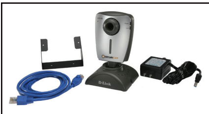
DLINKS Web Camera Kit