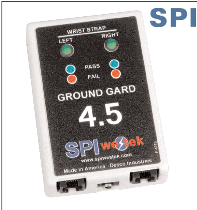
Figure 1. SPI Westek Ground Gard 4.5