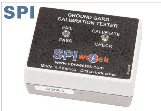
Figure 1. SPI 94335 Ground Gard Calibration Tester