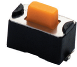
Gull Wing, 320g, Orange Actuator