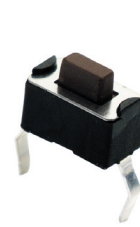
Thru-Hole, 160g, Brown Actuator

Used in applications such as consumer electronics, audio equipment, PCs, VCRs, cable boxes, modems, communications equipment, controls, security and alarm equipment, and test and measurement equipment.