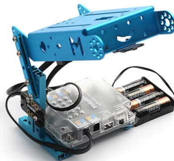
Intelligent voice-activated desk light

mBot Add-on Pack Interactive Light & Sound is a 3-in-1 pack based on mBot. You can construct "lighting chasing robot", "Scorpion robot" and "Intelligent voice-activated desk light " with mBot and the components in this pack. Each one has infinite possibility.