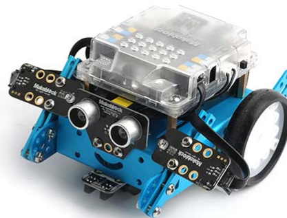
Lighting chasing robot