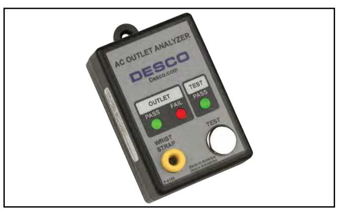
Figure 1. Desco <u>98132</u> AC Outlet Analyzer and Wrist Strap Tester