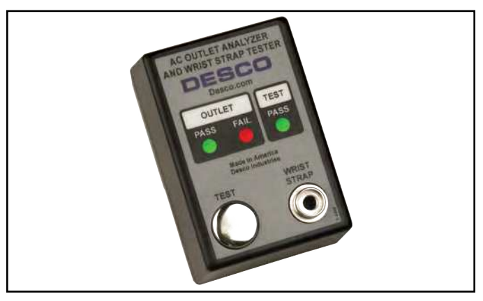
Figure 2. Desco <u>98131</u> AC Outlet Analyzer and Wrist Strap Tester