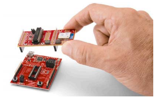
The A2530E24A BoosterPack snaps onto the MSP430 LaunchPad (shown) or the Tiva C LaunchPad (each sold separately).

The A2530E24A-LPZ BoosterPack kit eases the implementation of wireless for a wide range of applications, including: ZigBee Light Link control systems, Home/building automation, lighting systems, low power wireless sensor networks, consumer electronics, industrial control, monitoring, among many others.