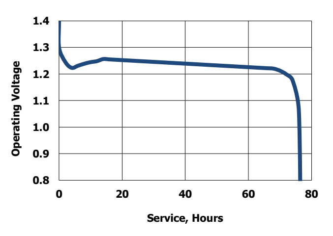
IEC Industry Standards / High Drain Test Protocol (10/2 mA .1S/1H59M 59.9S 12H at 21C)