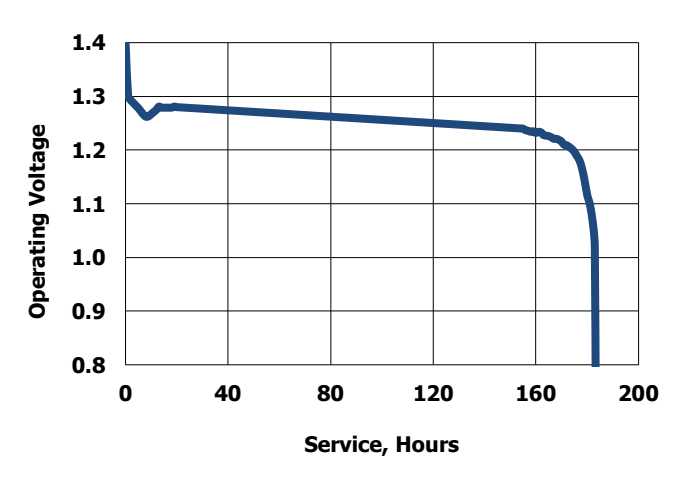
ANSI/IEC Industry Standards / Intermittent Test Protocol (1.5K ohm 12 hours per day at 21C)

Chemical System: Tab Color: Designation: Nominal Voltage: Typical Capacity: