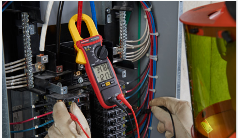
The Amprobe ACD-14-PRO can test and display voltage and current measurements simultaneously with the large backlit LCD dual display, for voltage drop tests and other applications.

Voltage drop test - dual display allows user to view voltage and current simultaneously to assess voltage drop for current changing from zero to a maximum value.