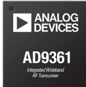
2 × 2 Agile RF Transceiver IC