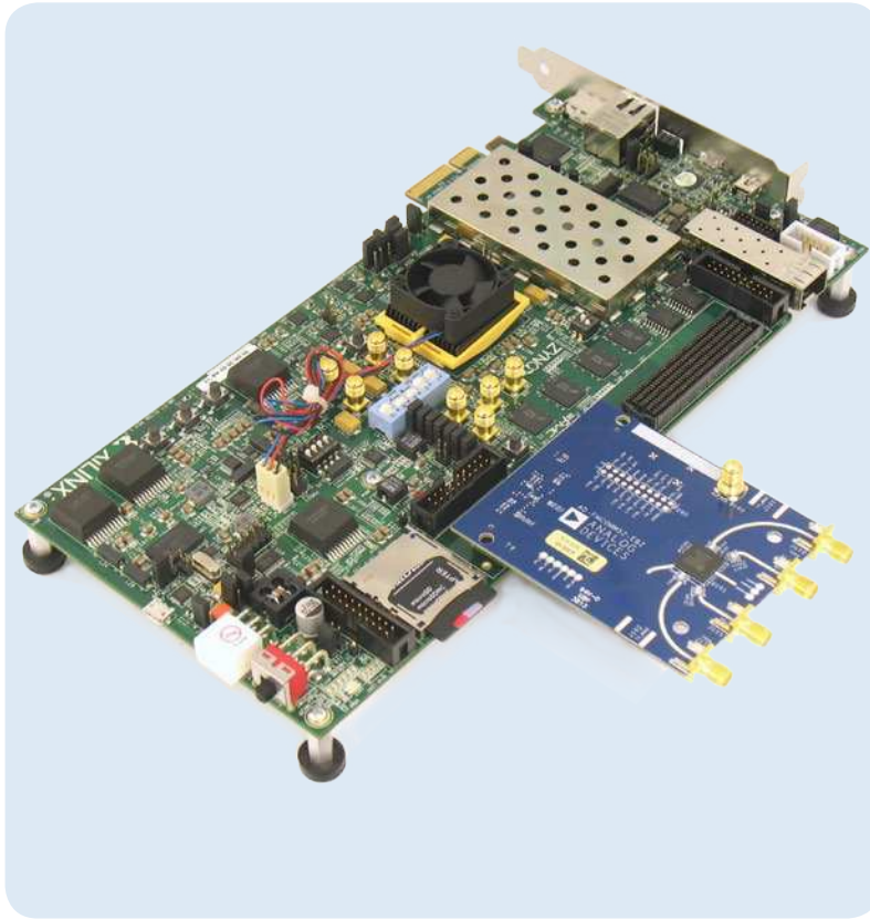
AD-FMCOMMS2-EBZ connected to Xilinx Zynq®-7000 All Programmable SoC.

The AD-FMCOMMSx-EBZ rapid development and prototyping boards are a family of high speed analog FMC modules, incorporating the AD9361 or AD9364 agile RF transceiver ICs, or a discrete signal chain, that seamlessly connects to the Xilinx FPGA development platform ecosystem. These boards are fully customizable by software without any hardware changes and come with downloadable Linux® drivers and bare metal software drivers, schematics, board layout, and design-aid reference materials, all contained on their respective Analog Devices wiki sites.