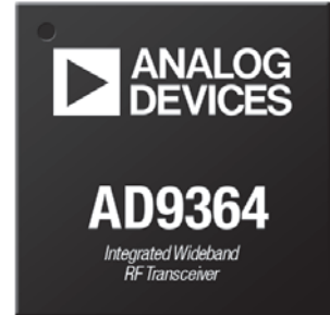
1 × 1 Agile RF Transceiver IC