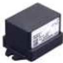
10A PC board type