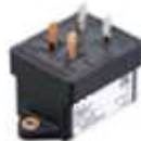
10A TM type