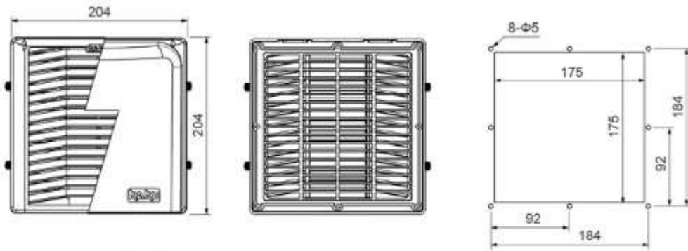
with rain hood