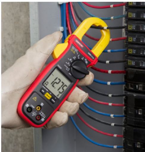
AMP-310 AC Clamp Meter HVAC