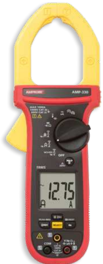
AMP-330 AC/DC 1000 A Clamp Meter Industrial Motor Maintenance