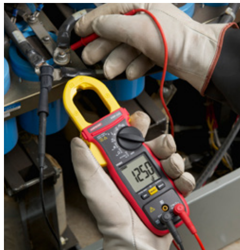
AMP-320 AC/DC Clamp Meter Electrical Motor Maintenance