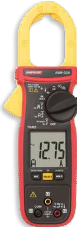
AMP-320 AC/DC Clamp Meter Electrical Motor Maintenance