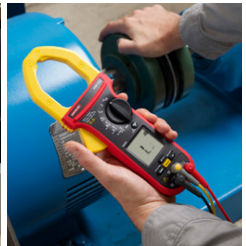
AMP-330 AC/DC 1000 A Clamp Meter Industrial Motor Maintenance