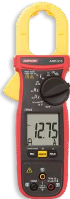
AMP-310 AC Clamp Meter HVAC