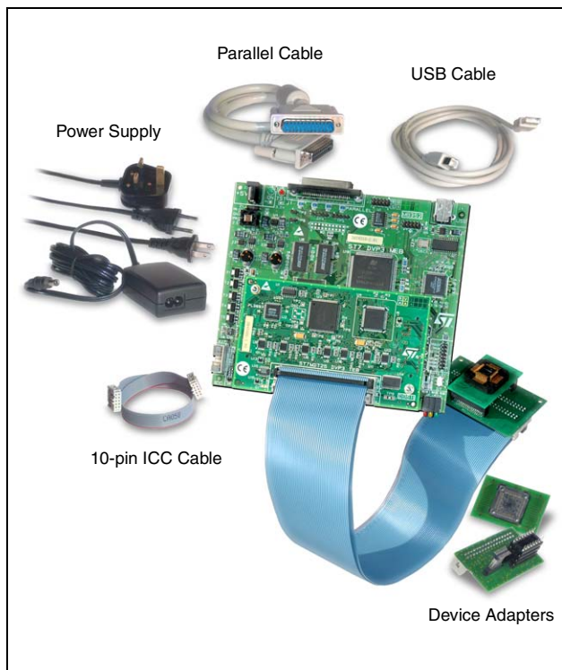
Figure 1: ST7-DVP3 Emulator

Main Emulation Board – Provides the communication interface with the host PC via parallel or USB connection when working in both the Emulation and ICC configurations. Any Main Emulation Board for the DVP3 series can be adapted to emulate a supported ST7 with the appropriate Target Emulation Board and Connection kit. This board also includes the system's ICC connection, which allows you to connect to the ST7 on your application board via a 10-pin ICC cable and an ICC connector that you install on your application board.