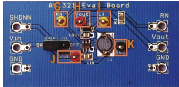
Figure 2: Board Description - Measurement Points