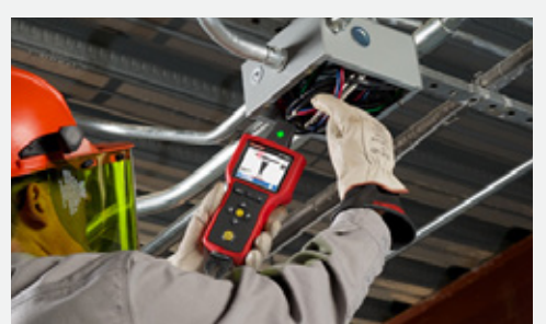
race energized or de-energized wires by removing the junction