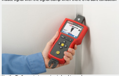
Use the Tip Sensor to trace wires in hard to reach areas