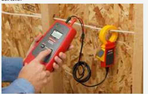
Induce signal with the signal clamp when there is no bare conductor