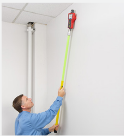
Trace wires in hard to reach places with the TIC 410A.