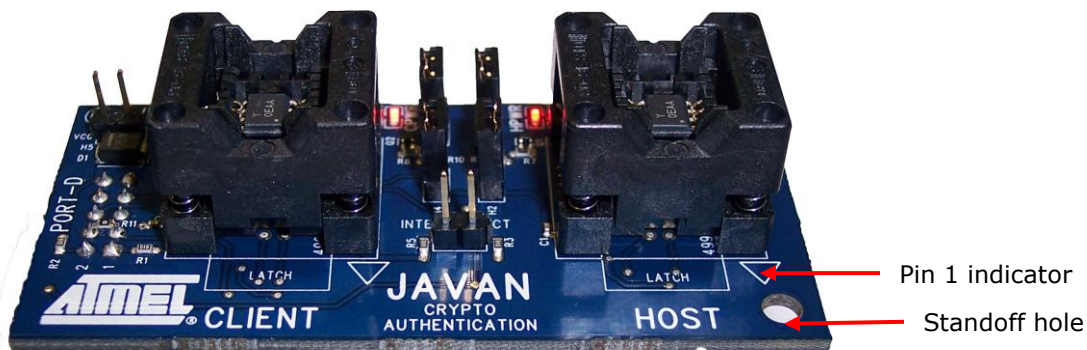
Figure 1-1. Atmel AT88CK109BK8 daughterboard

Atmel® AT88CK101BK8 is a daughterboard that interfaces with a mcu board via a 10-pin header. The daughterboard has two 8-pin SOIC sockets which can support HOST and CLIENT development with an Atmel ATSHA204 device. This kit uses a modular approach, enabling the daughterboard to connect directly to an STK series AVR development platform to easily add security to applications. An optional adapter kit is also available when the 10-pin header on the daughterboard requires a different pinout. The AT88CK109BK8 is sold with the Atmel AT88Microbase to form the Atmel AT88CK109STK8 starter kit. The AT88Microbase AVR base board comes with a USB interface that lets designers learn and experiment on their PCs.