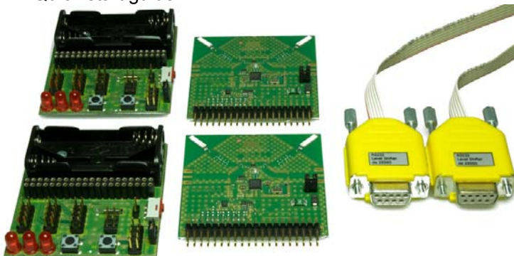
From left to right: 2 x CBB, 2 x REB, 2 x RS232 cable.