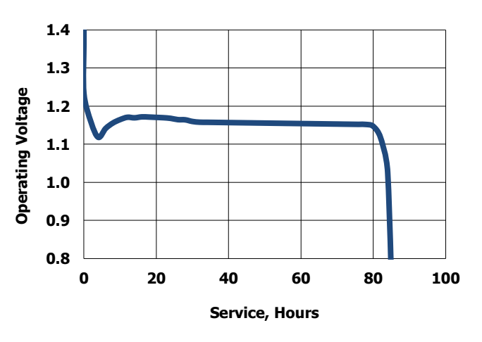
IEC Industry Standards / High Drain Test Protocol (5/1 mA .1S/1H59M 59.9S 12H at 21C)