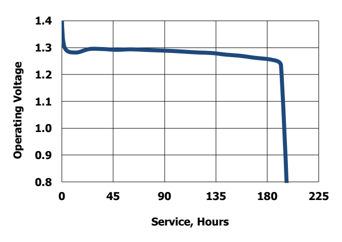
ANSI/IEC Industry Standards / Intermittent Test Protocol (3K ohm 12 hours per day at 21C)

Chemical System: Tab Color: Designation: Nominal Voltage: Typical Capacity: