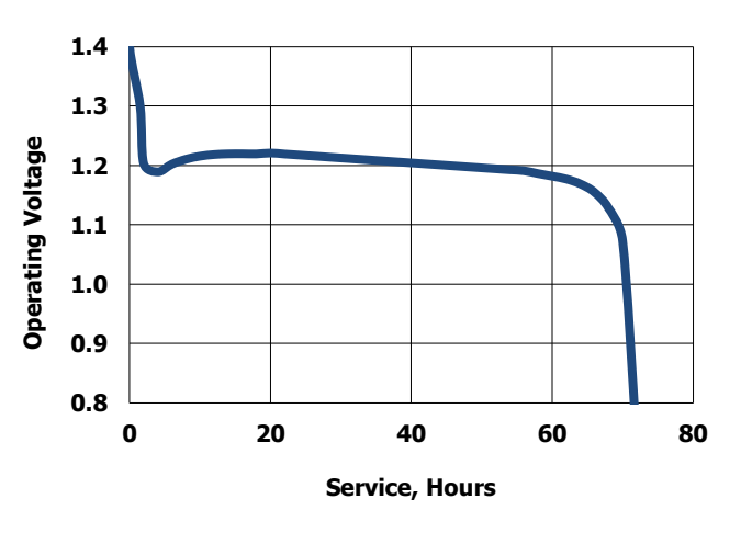
IEC Industry Standards / High Drain Test Protocol (24/8 mA .1S/1H59M 59.9S 12H at 21C)