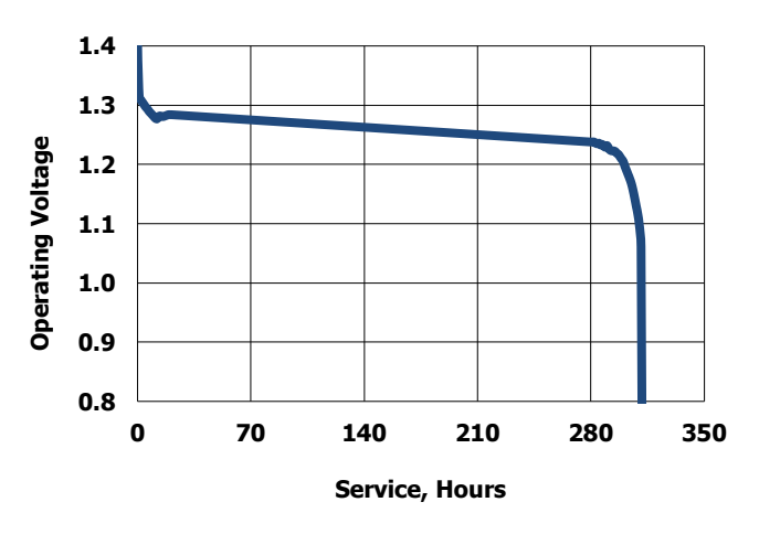
ANSI/IEC Industry Standards / Intermittent Test Protocol (620 ohm 12 hours per day at 21C)

Chemical System: Tab Color: Designation: Nominal Voltage: Typical Capacity: