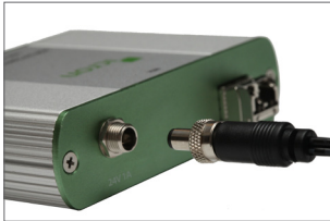
Locking Power Connector