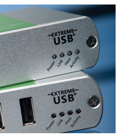
Specifications subject to change without notification. © 2013 Icron Technologies Corp. #90-01097-A01