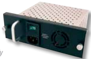
Optional, additional power supply

The model EIS2-EXTEND extends your copper Ethernet connections up to 2600 meters (8,530 feet) over twisted pair wire. The Ethernet Extender fully complies with IEEE 802.3 10BaseT and IEEE 802.3u 100BaseTX standards. Two EIS2-EXTEND models are required for the Ethernet extension, (one at each end of your extension points). The EIS2-EXTEND's design features high shock, vibration, electrical noise immunity, a wide operating temperature range from -10C to 60C and ruggedized housing. The EIS2-EXTEND can be used with included power supply or in the EIS-RACK-16, 19-inch rack mount chassis used to house up to 16 EIS2-EXTEND units.