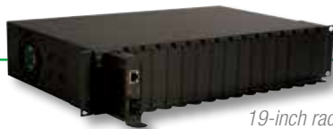
19-inch rack system with power supply