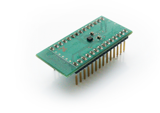
Note: Product photo may differ from real product's appearance.

The Bosch Sensortec BMA222E shuttle-board is a PCB with a BMA222E acceleration sensor mounted on it. It allows easy access to the sensors pins via a simple socket. As all Bosch Sensortec sensor shuttle boards have identical footprint, they can be plugged into Bosch Sensortec's advanced development tools (e.g. the Development Board). Of course, the BMA222E shuttle board can also be used for customer's own implementations.