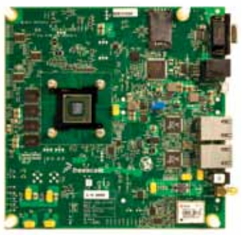
BSC9131 Reference Design Board

For more information about the QorlQ Qonverge BSC913x family, visit freescale.com/QorlQQonverge