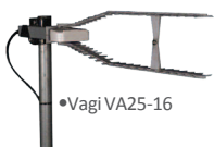
• Vagi VA25-16

The Vagi/Yagi Series are rugged, easy-to-install, high-gain directional antennas used in a wide variety of wireless systems where low cost, good performance and low wind loading are important factors. They include either a VPOL or HPOL configuration, along with a 1.5 VSWR as well. These antennas can be pole mounted in outdoor environments.