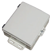
• DCE 7x6x2

The Die-Cast Enclosure (DCE) series offers a directional VPOL panel antenna that is contained within a die-cast aluminum enclosure. The enclosure adds to the long life of the antenna in outdoor environments. The powder coat paint over aluminum construction offers unsurpassed resistance to corrosion. The die-cast enclosure has extra heavy duty mounting flanges for reliable mounting to poles or surface mounting to walls along with the inclusion of seven engineered hole knockouts which allow for many different configurations of connectors and feedthrus without the need for drilling holes.