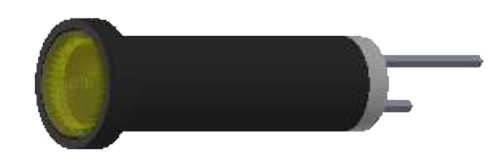
ISOMETRIC VIEW ONLY FOR REF.

The information in this document is the exclusive PROPRIETARY property of VISUAL COMMUNICATIONS COMPANY, LLC. It is disclosed with the understanding that acceptance or review by the recipient constitutes an undertaking by the recipient: (1) to hold this information in strict confidence (2) not to disclose, duplicate, copy, or use the information, in whole or in part, for any purpose other than that for which disclosed